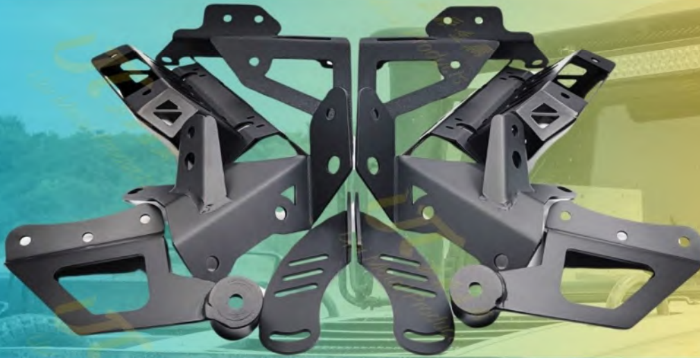
LED LIGHT BAR MOUNTING BRACKET